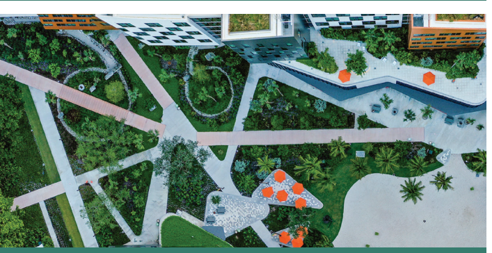
UNIVERSITY OF MIAMI LAKESIDE VILLAGE