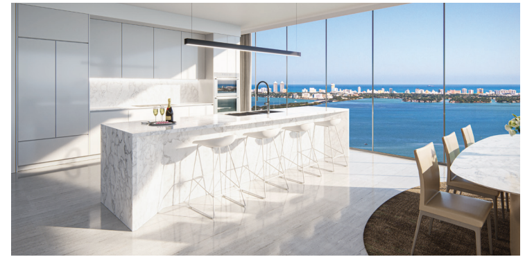
ARTISTIC CONCEPTUAL RENDERING